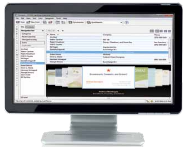
Microsoft Outlook Add-In View

* Included for CardScan Executive and CardScan Team